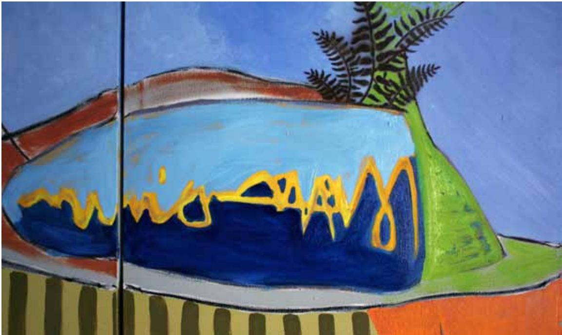
Isolate Flecks (Detail) Oil on canvas

To experience the paintings of Patrick Chamberlain is to feel human. As you enter the pewter-gray gallery at Artspace, Chamberlain's radiant abstract paintings fairly burst from the walls, pulsating with colors that command attention. Feverish reds, turquoise blues, brilliant yellows, and flamingo pinks punctuate his canvases, arresting your gaze. The exuberant colors draw you into the darkened room where the artist's pictures offer moments of amusement, ease, agitation, desire, and desperation — a small sampling of the human emotional spectrum.