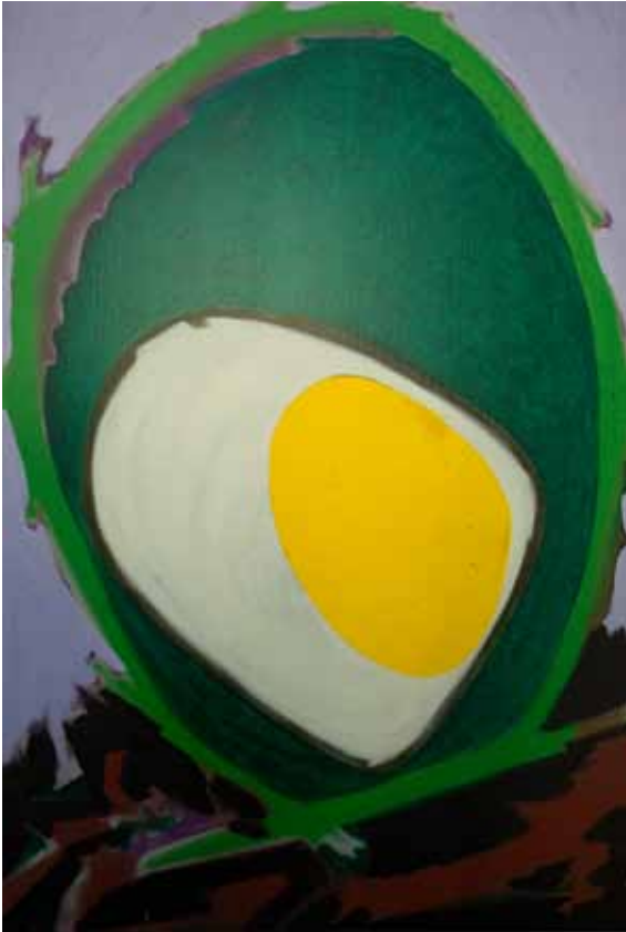
fig. v. OOF Vert , 2008 Oil on canvas