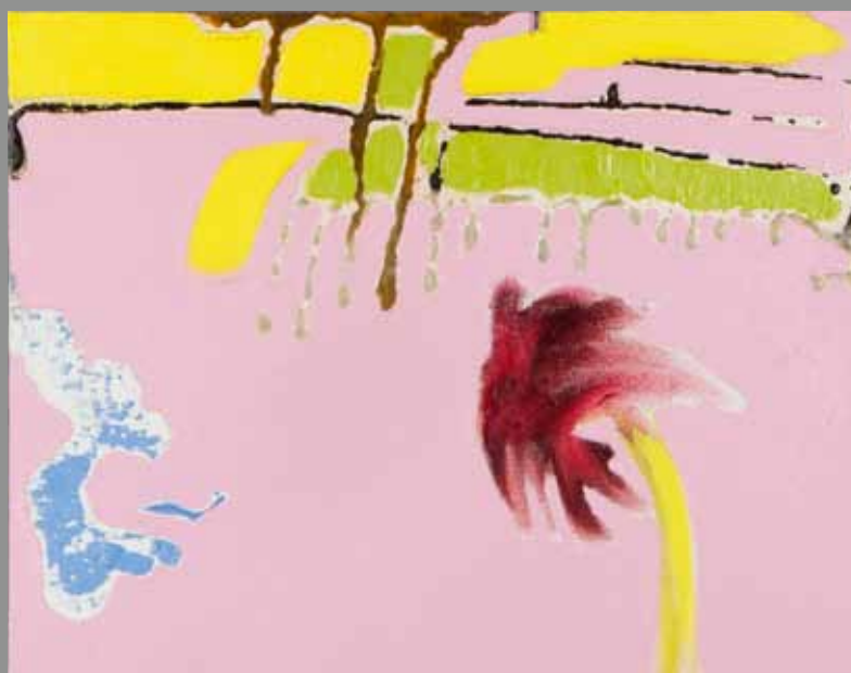
Little Pink Guy, 2009 Oil on canvas