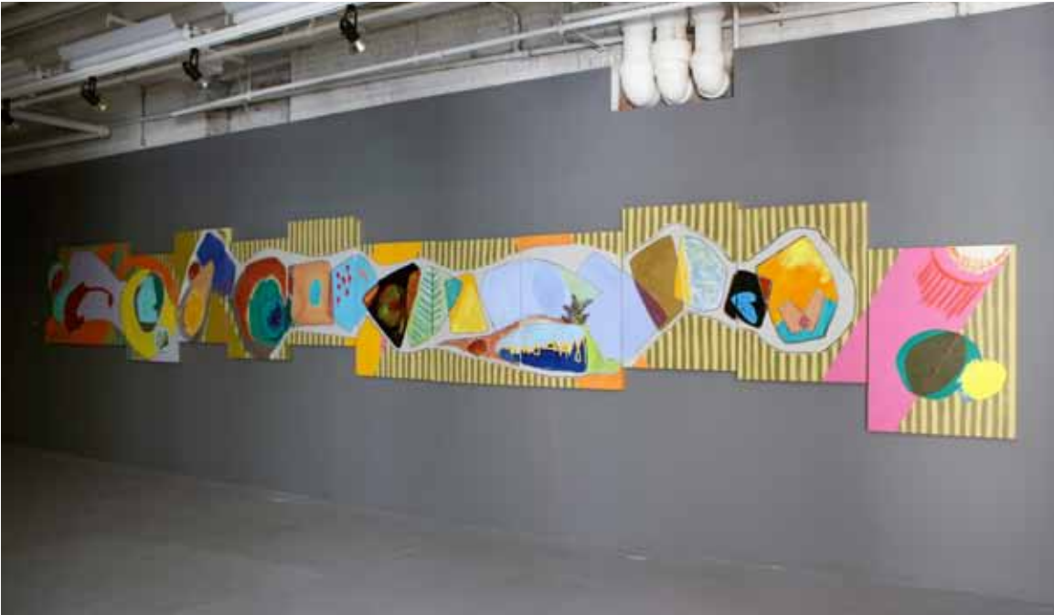
fig. iii. Isolate Flecks , 2010 Oil on canvas