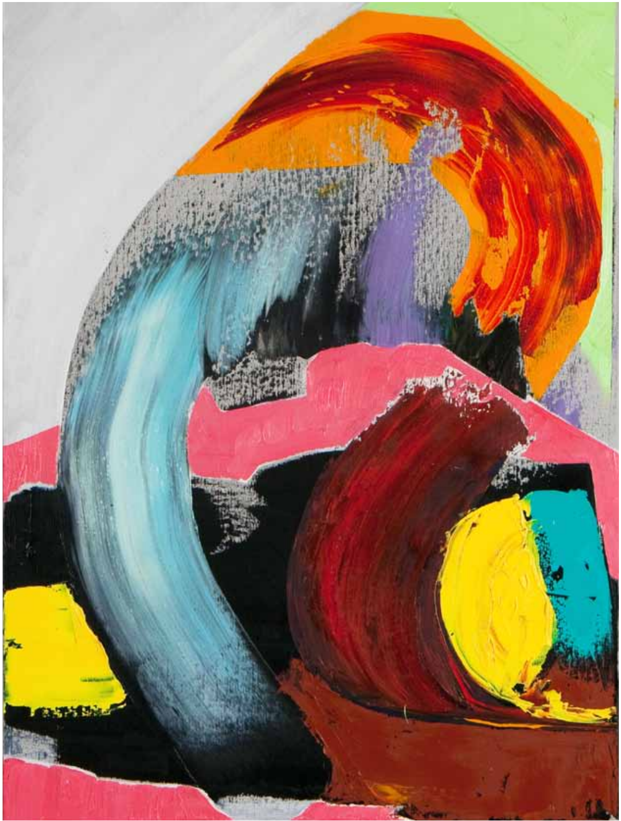
fully Hokusai, 2007 Oil on canvas