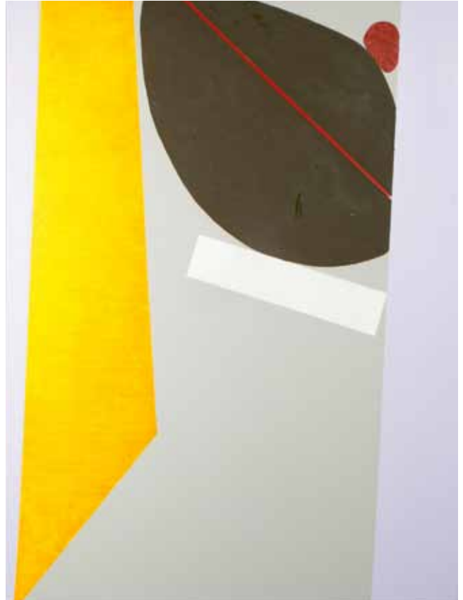
fig. vi. Untitled , 2008 Oil on canvas