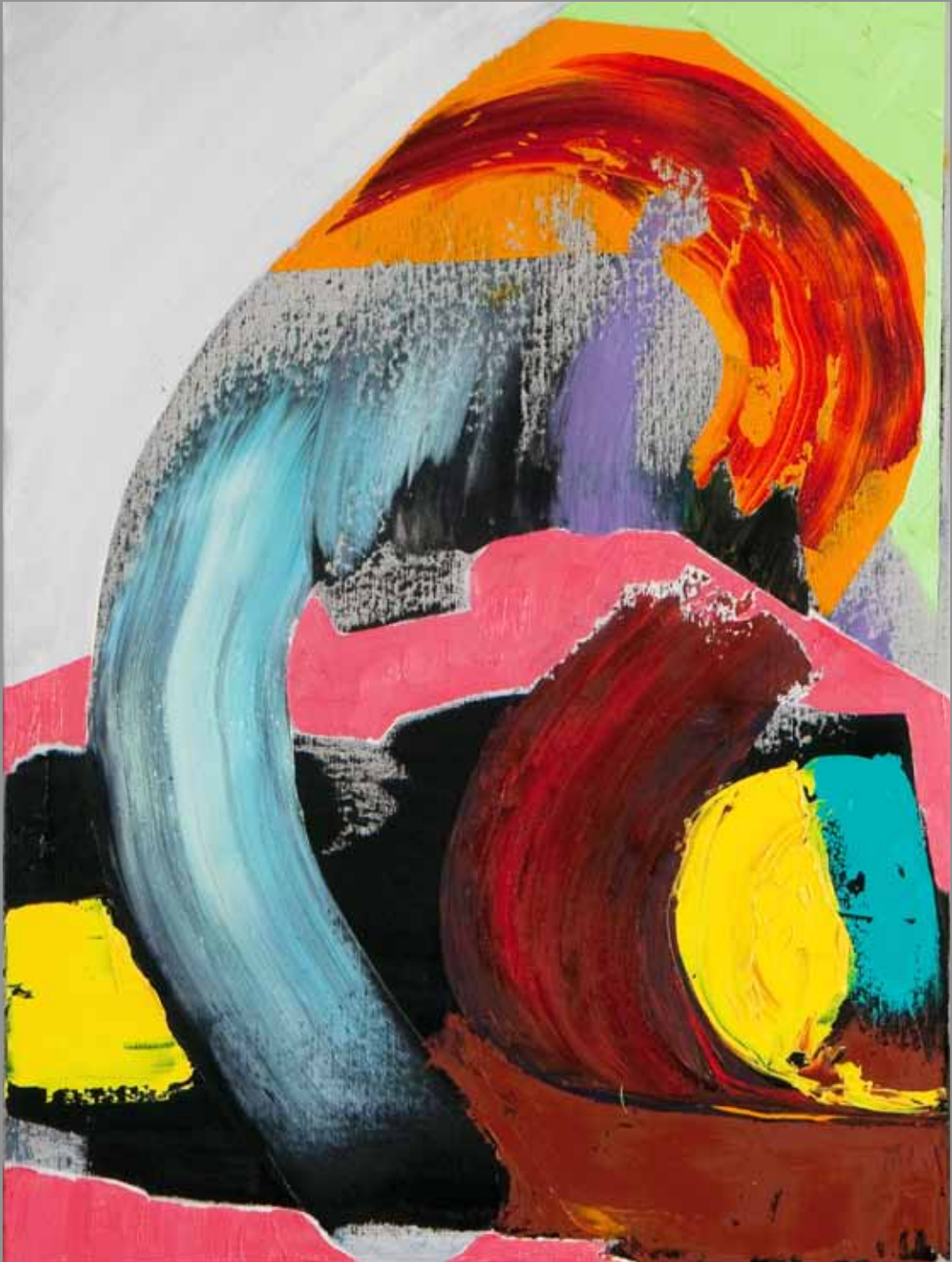
fully Hokusai, 2007 Oil on canvas