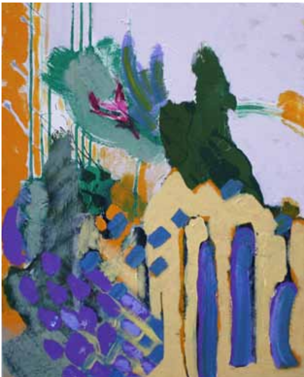
fig. ii. Perhaps a Garden , 1997 - 2004 Oil on canvas