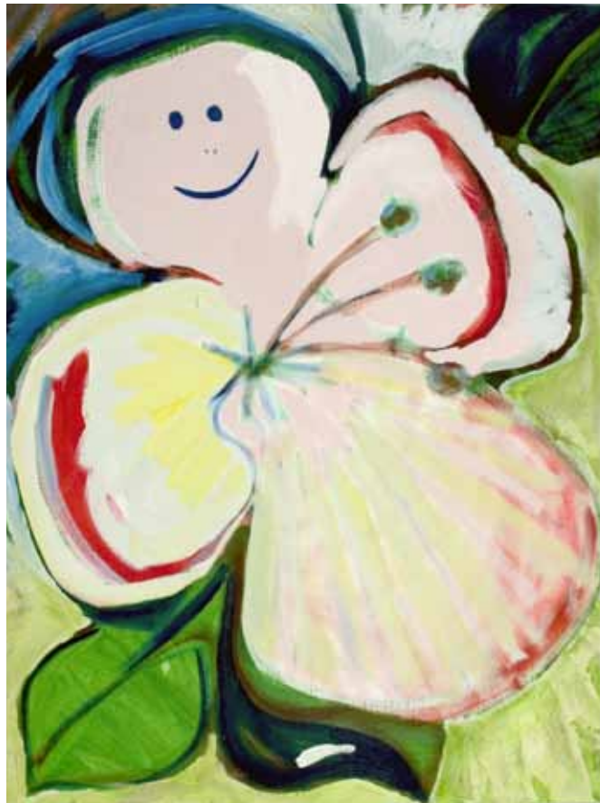
Happy Flower Painting for Georgia O'Keeffe, 1997 Oil on canvas