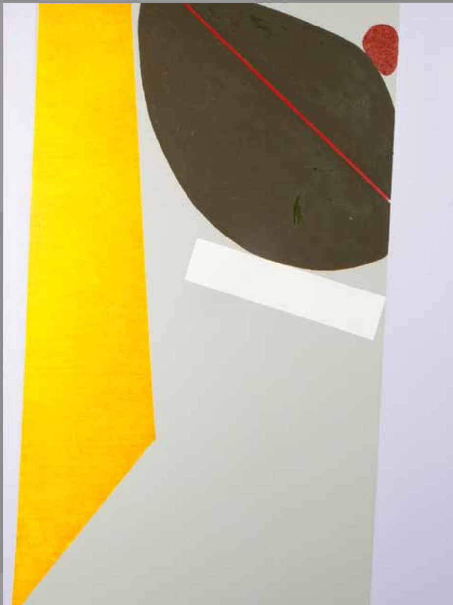
Untitled , 2008 Oil on canvas