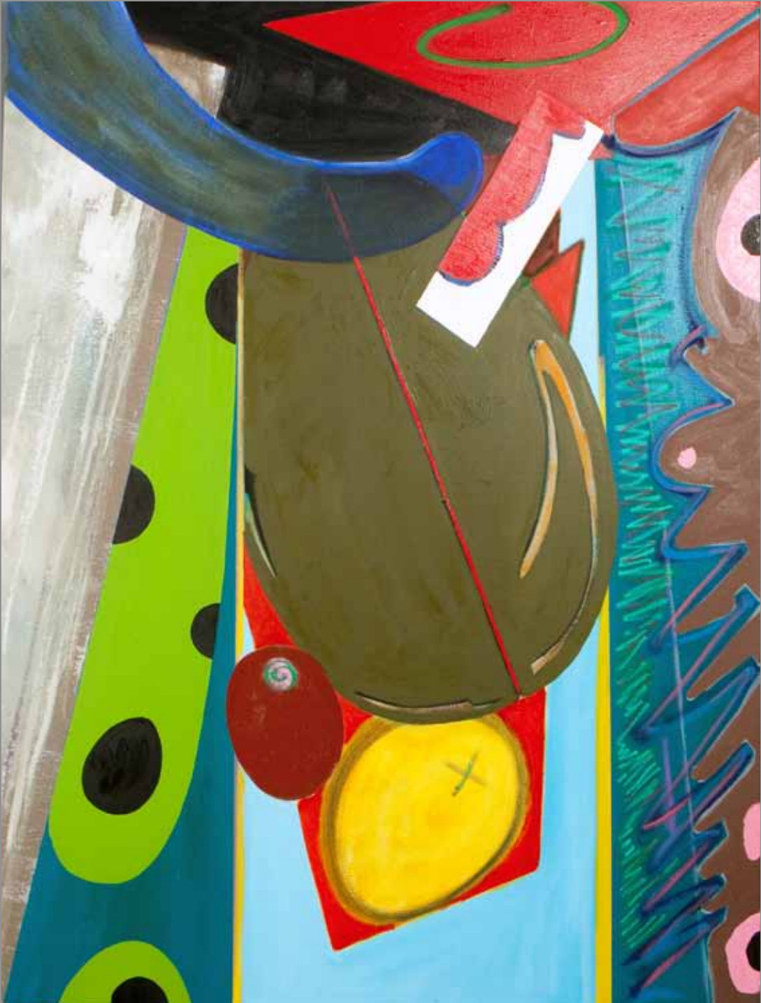
For Elizabeth , 2007 Oil on canvas