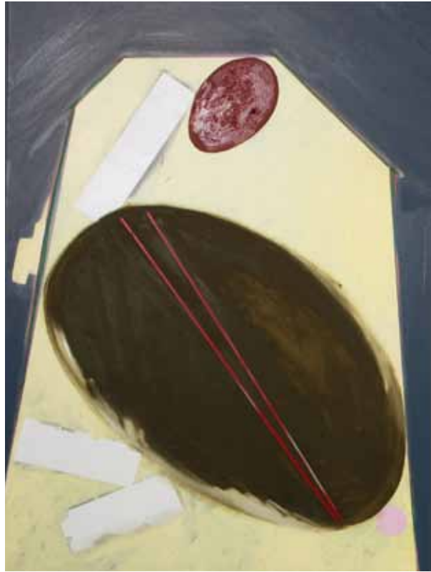
fig. iv. For Leo , 2007 – 08 Oil on canvas

Like Williams' Elsie , Chamberlain's Isolate Flecks (2010) embodies conflict and repression. Williams' language reveals the intimacy and distance with which he beholds his subject. Chamberlain juxtaposes abstraction with figuration and objectivity with expression to convey a similar tension between the sensual and mental experiences of living in the body. In the painting, the cocoon-like form is an organic container for body parts that are neither fully formed nor connected. Areas of transparent color contrast with opaque patches of paint, and the alternating densities of color suggest expressive states of being, ranging from the exalted to the depressed.