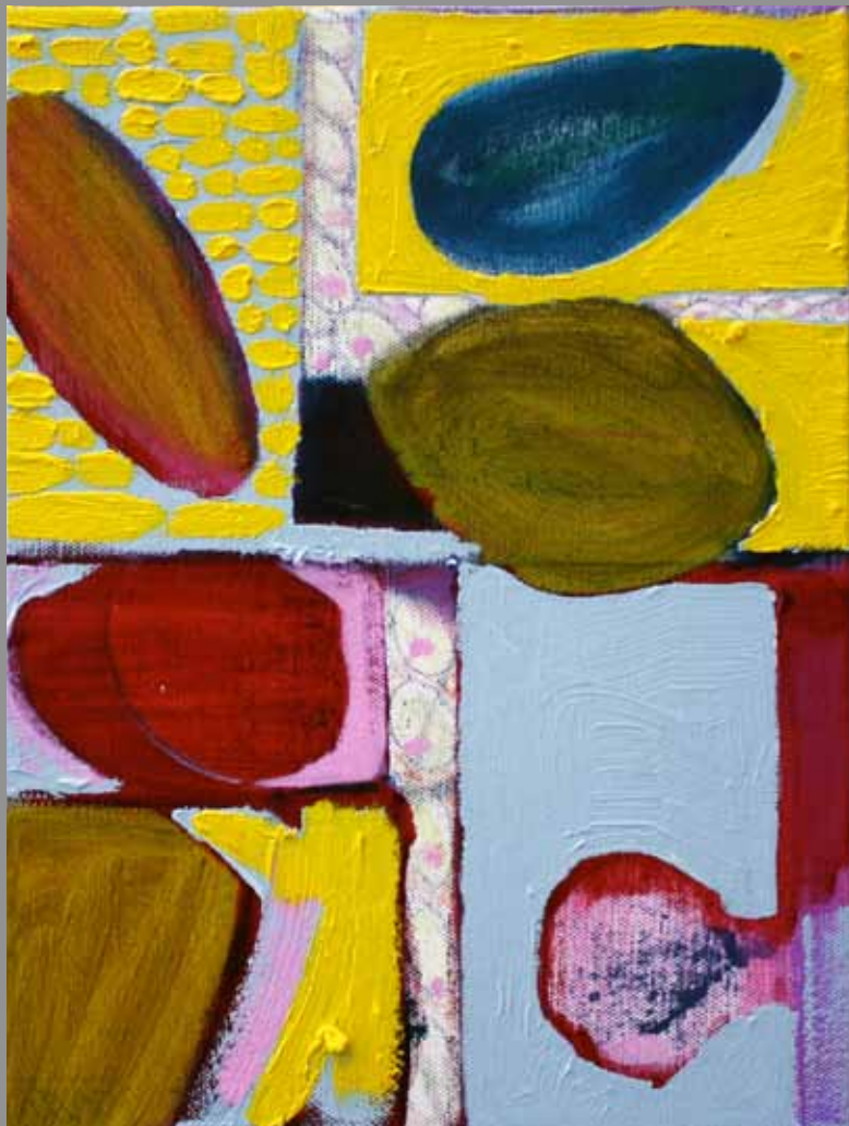
The One Right Next to "For Leo", 2009 Oil on canvas