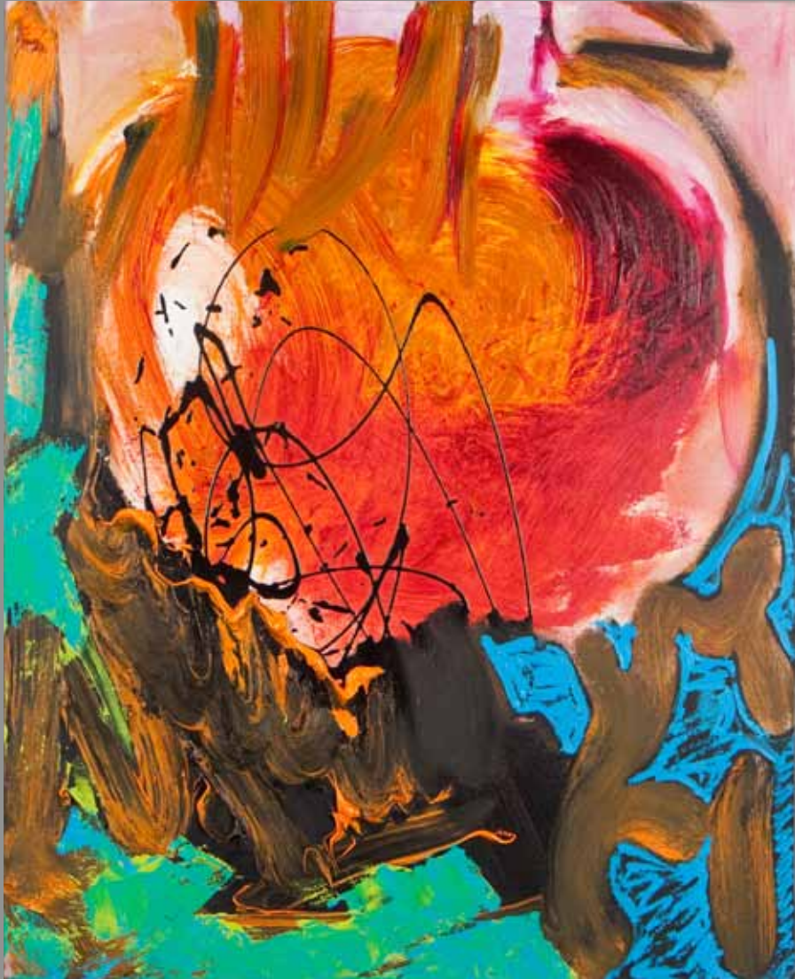
Untitled , 2008 Oil on canvas