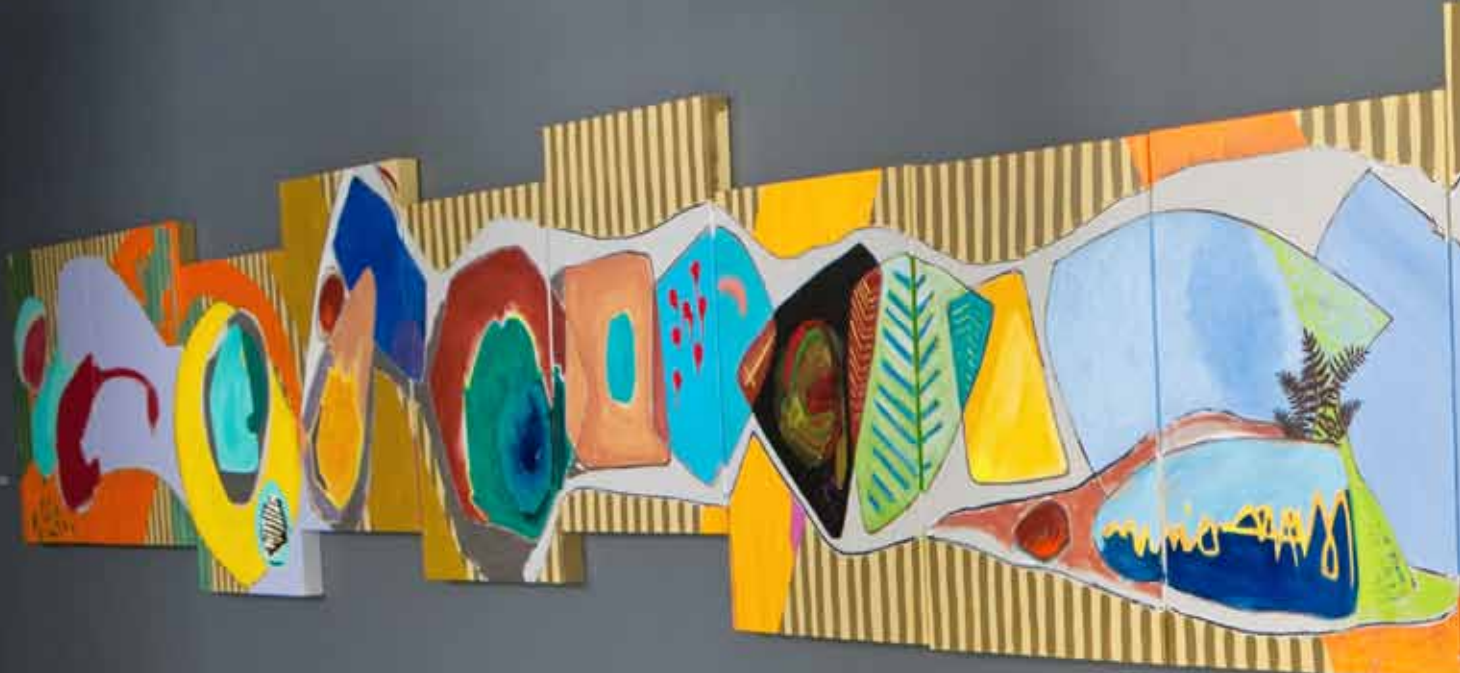
Installation view Isolate Flecks , 2010 Oil on canvas