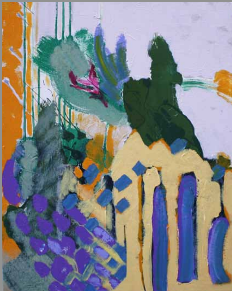
Perhaps a Garden , 1997 – 2004 Oil on canvas