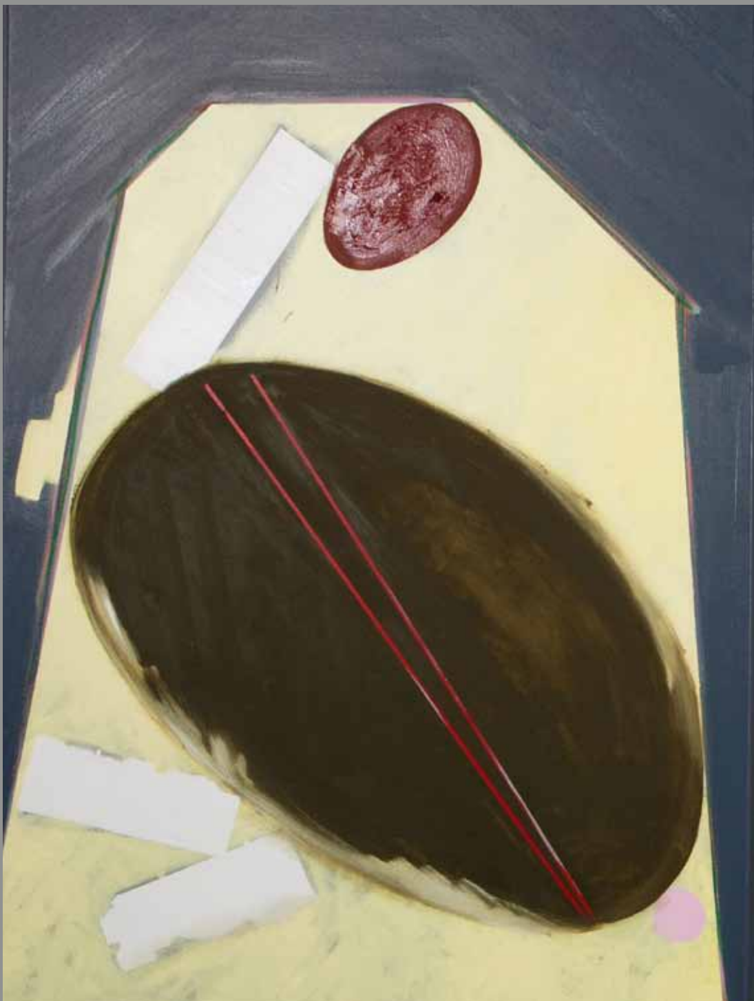
For Leo, 2007 Oil on canvas