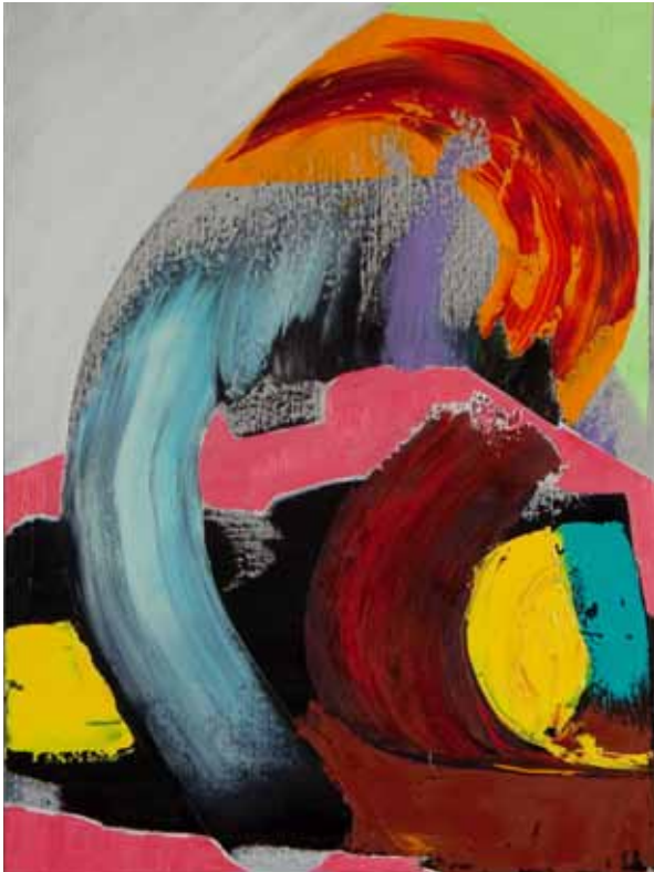
fig i. fully Hokusai , 2007 Oil on canvas